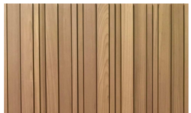
vertical natural timber backdrop

Contractor to allow supply and fix of: Natural Planed Douglas Fir best grade, No. 2 clear and better cladding 20x100mm (L), 20x50mm (S), laying pattern (L)(L)(S), (L)(L)(S), (L)(L)(S)... 8mm vertical gaps and random staggered butt joints (2.4m in length). 2 x Nails at 600mm equal centres to 25 x 38mm horizontal sw battens painted black and screw fixed to existing masonry. Black UV resistant breather membrane or building paper